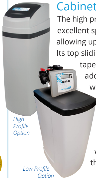
High Profile Option

The low profile allows full access to the control valve for programming and servicing without having to remove the cover.